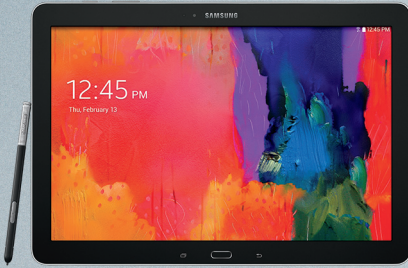
Galaxy Note® Pro 12.2

Choose from a Diverse Portfolio of Knox-Enabled Samsung Galaxy Devices Designed for Business.