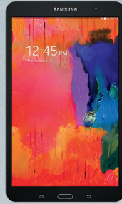
Galaxy Tab Pro 8.4