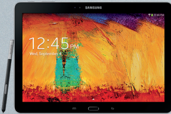
Galaxy Note® 10.1 2014 Edition